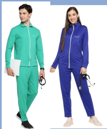
FULL SLEEVE SCRUBS